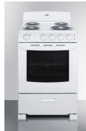
24" Wide RE2411W